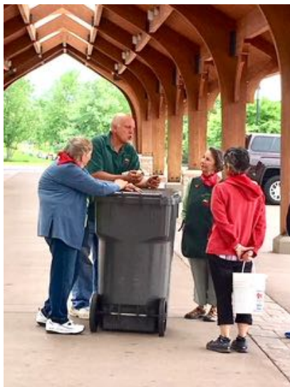
Another year, another plant sale done!

The annual ECAMGA Plant Sale held at Phoenix Park was held on Sunday, June 10, 2018. It was a nice day, a little windy but no rain or storms. The sale took in a gross of $1,813.50. When all expenses are paid the planning committee will let members know the profit.