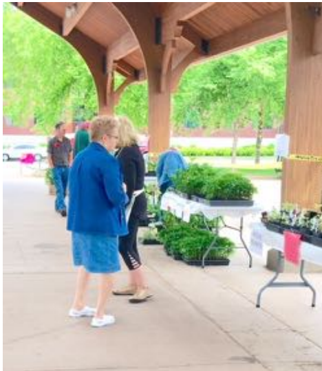
Should I or shouldn't I?