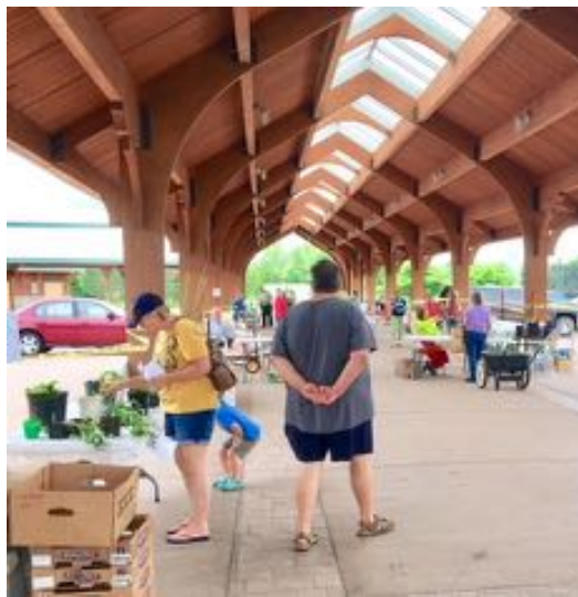
A great place to shop...