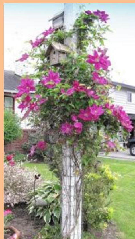
A funky combination – clematis and birdhouse penthouses!!