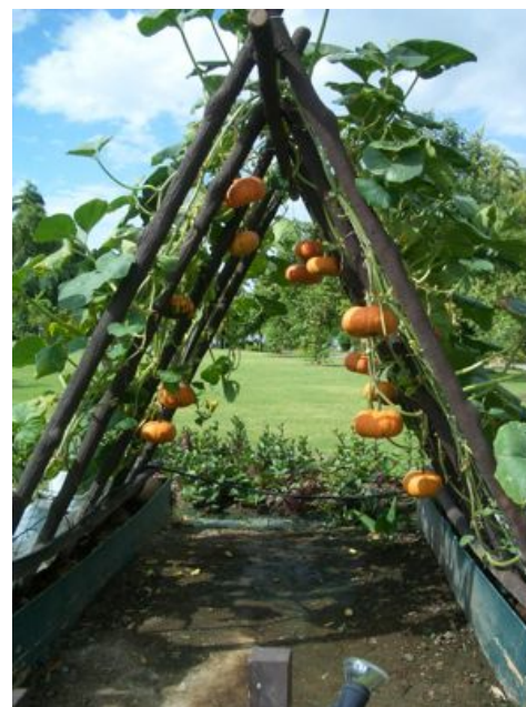
An interesting idea for vine fruits and vegetables!