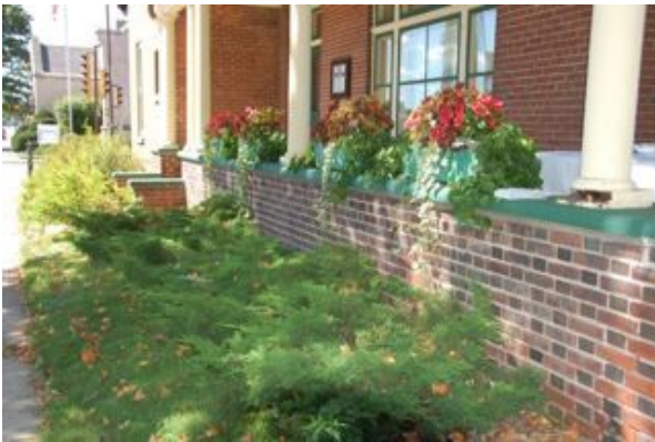
of Schlegelmilch House window Boxes.