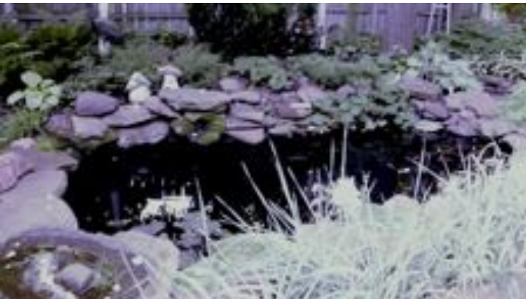
One of the seven ponds in the Steinke gardens.

After leaving the Steinke garden the group ended up at Carol Cox's garden at 1908 Hogeboom Avenue (also a 2008 Symphony Tour garden) with the added bonus of Jo-Ann Clark opening her backyard garden gate to allow the guests to also tour her garden area, which includes a koi pond and shade gardens.