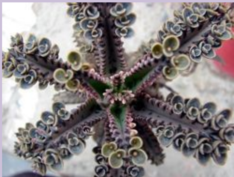
Mother of Thousands Plant (Kalanchoe) – easy to grow and very interesting!!