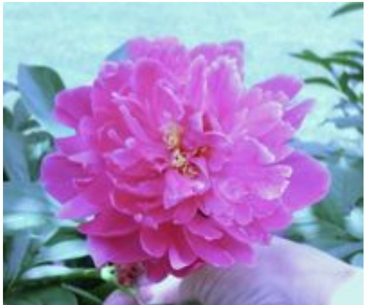
The peony that Carol raised from seed (thought to be a cross between two existing peony bushes she has).

After spending some time there the group headed up to the Larry and Carol Steinke's gardens at 1405 Emery Street (this garden was on the 2008 Chippewa Valley Symphony Tour) where they got to see the seven ponds and garden areas as well as Carol's prized peonies.