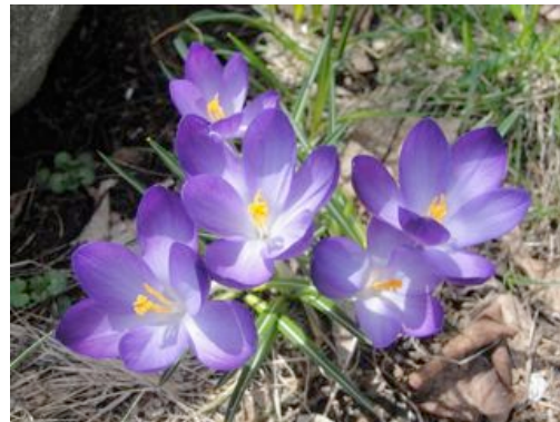
“What Lies Beneath The Snow”