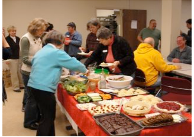
and a great feast was enjoyed by all...